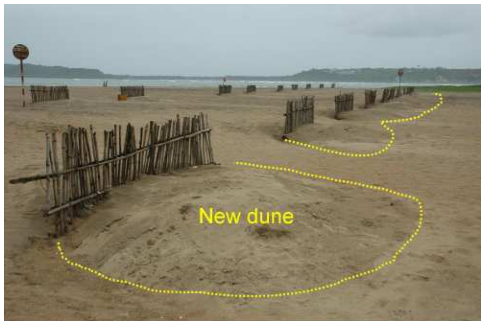
Fig.2. Two frontal rows of sand fences, fixed in April 2007. Maximum amount of sand was trapped by the second row of fences. Around 2 cubic meters of sand accumulated behind a single fence by 20 July 2007.

Following several field checks, and in collaboration with the municipal authorities, it was decided, on an experimental basis, to erect parallel rows of 3 m long fences with 2 m wide passages in between. Fences were oriented in a NNW-SSE direction. The second row was placed 25 m behind the frontal row. The southern end of the frontal fence was fixed about 55 m from the water line and about 30 m behind the existing dune line so that the fence is