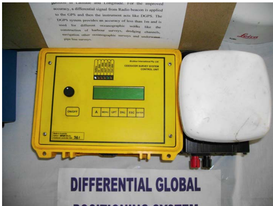
Fig:4. “Ceeducer” Differential Global Positioning System, which can be used for obtaining accurate geographical and UTM co-ordinates of base stations “A” and “B”.