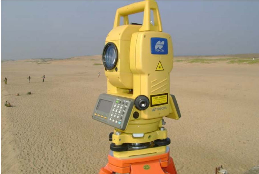
Fig: 3. Latest Electronic Total Station GPT-3002N model instrument, that can be used for transferring G.T.S. benchmark value to survey area using the suggested method.