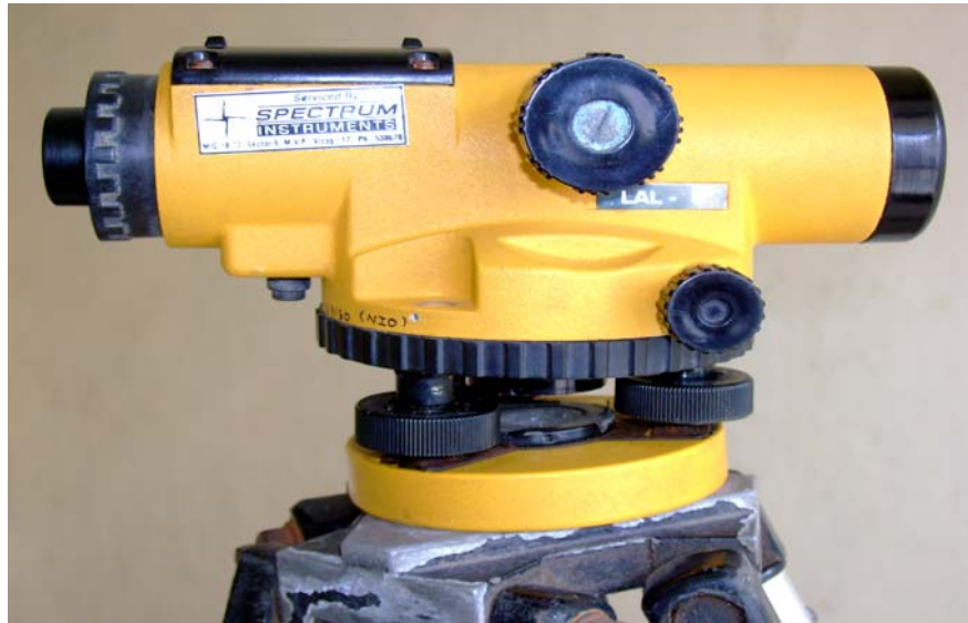
Fig:1. An Automatic Level instrument used for transferring benchmark, by the traditional method.