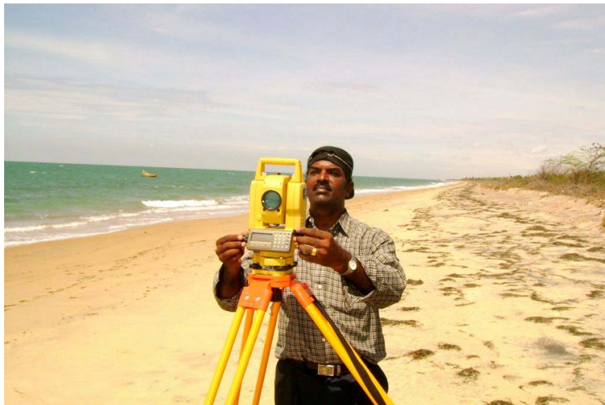
Fig: 7. A survey party carrying out delineation of high tide line and low tide line surveys from newly established bench mark station in a survey area (TBM:10), using Electronic Total Station instrument.