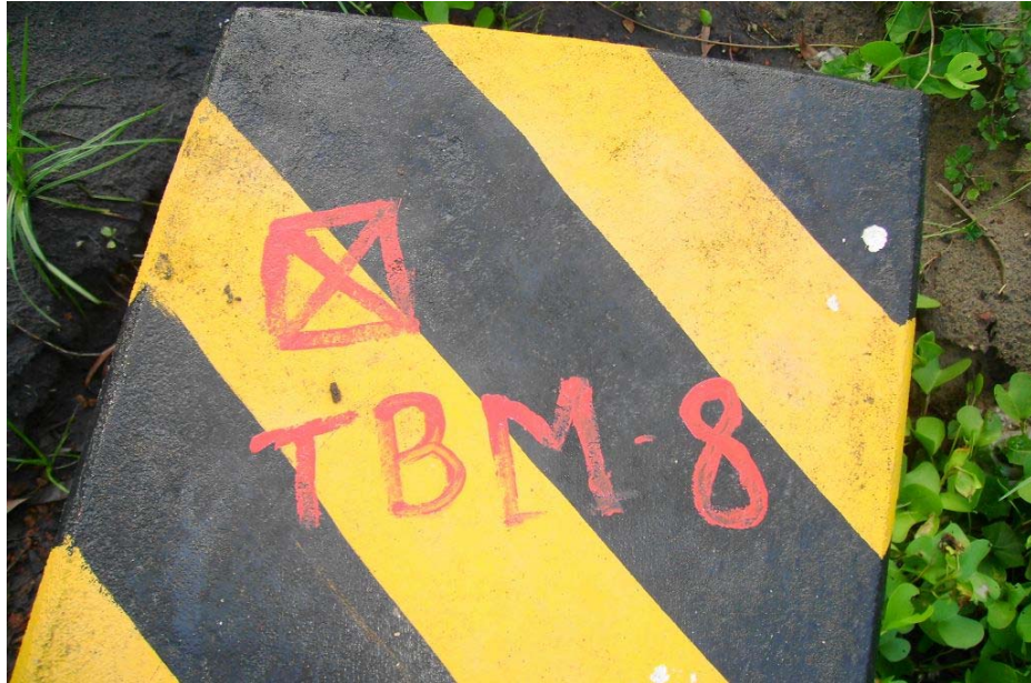
Fig: 6. One of the temporarily transferred benchmarks established above a road-side culvert, by a survey party. Same benchmarks were used for counter checking the elevation using Electronic Total Station.