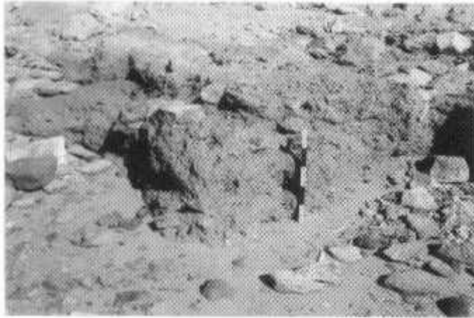
Figure 3. An early historical site on the western coast of Bet Dwarka island, exposed during low tide (scale: 50 cm with 10 cm division).

centre for acquiring and processing raw materials for manufacturing articles for export. Discovery of two cylindrical stone anchors with tapering sides, and large holes bored vertically throughout the length and the overall geomorphology of the area corroborate that Kuntasi could have been a port situated at the creek mouth during the Harappan period.