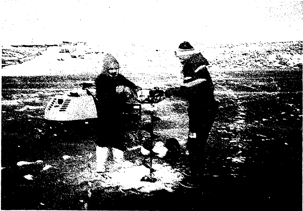
b. Drilling the lake ice for biological sampling