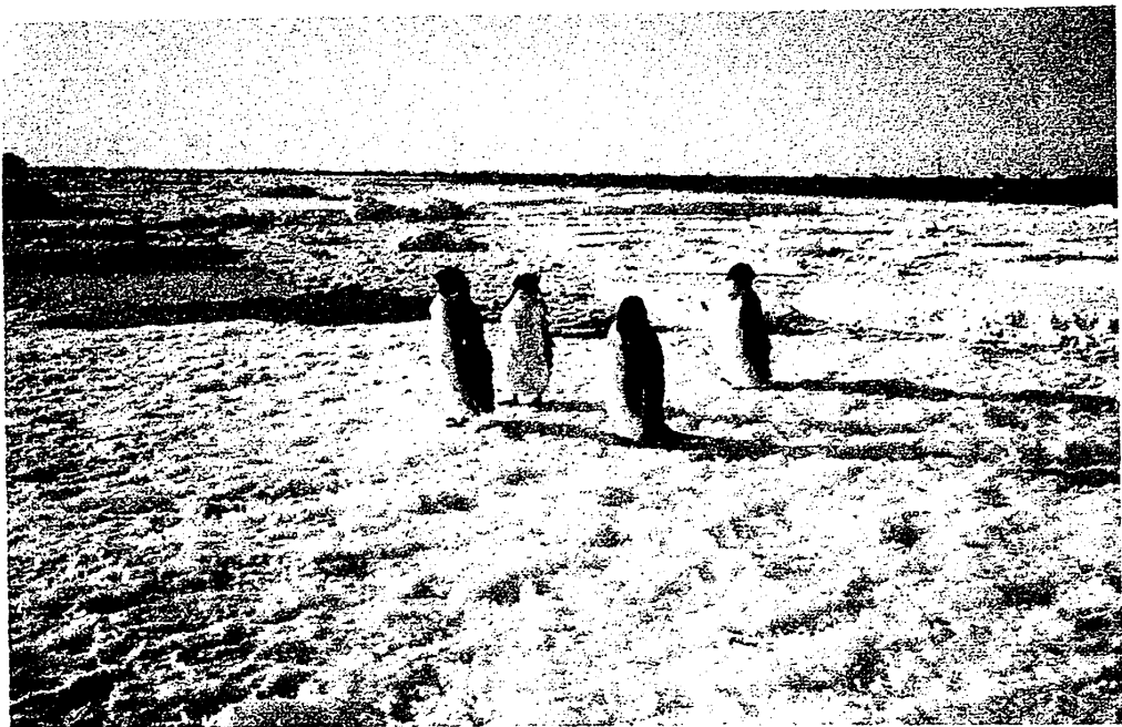
b. Adelie penguin on fast-ice