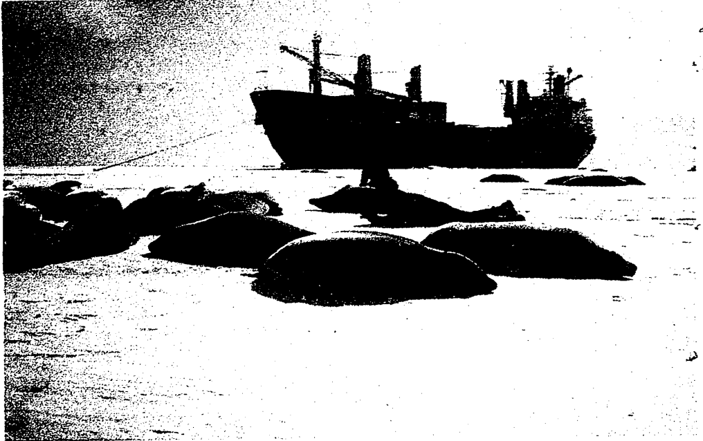
a. Crab eater seals on fast-ice