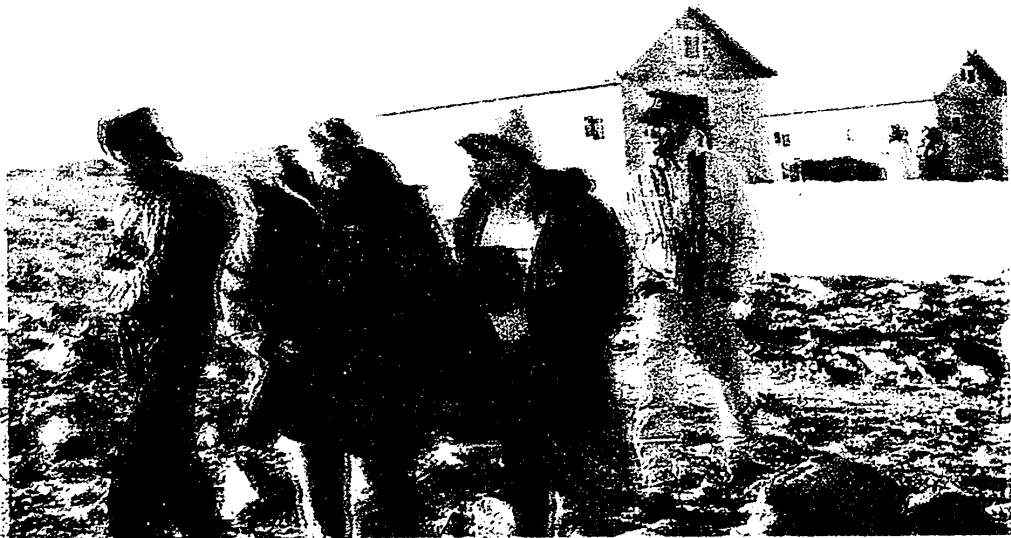
b. Members of the Swedish Inspection Team are taken around the Maitri Station.