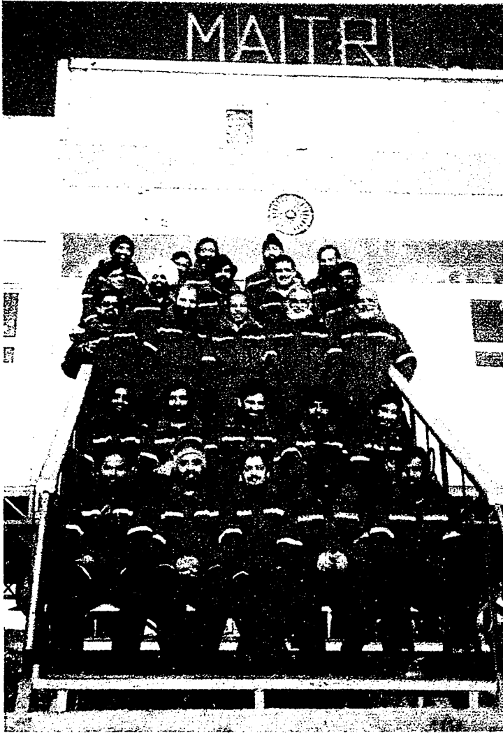
X Wintering Team