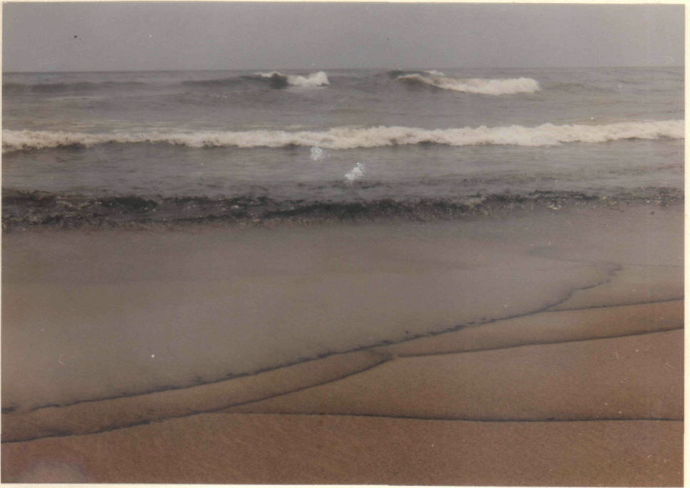
3. Oil patches clearly visible on the shore - Siquerim