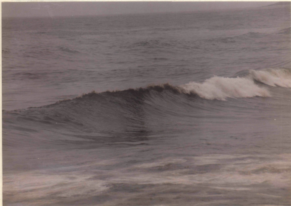
1. Oil patch drifting towards the shoreline - Siquerim