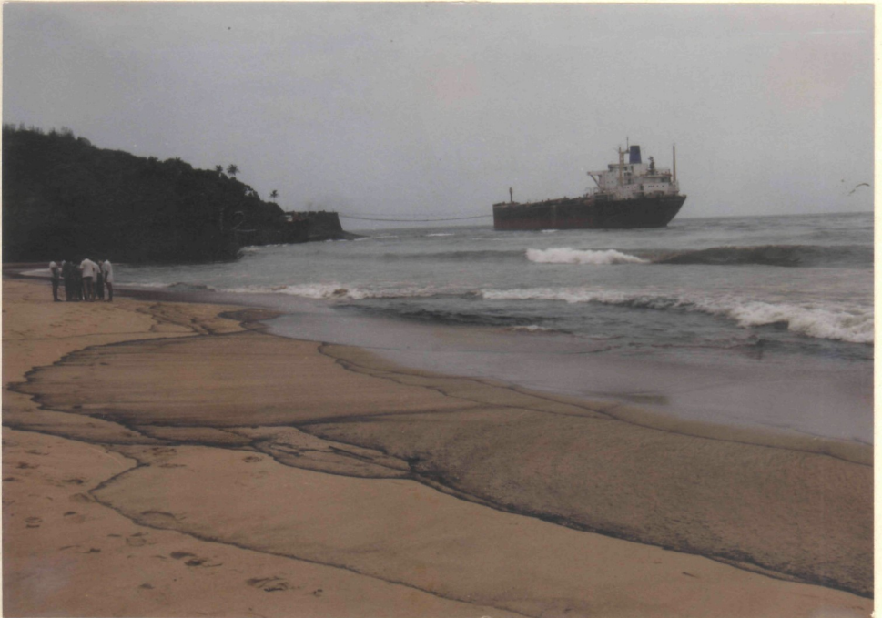
4. Oil contaminated beach - Siquerim