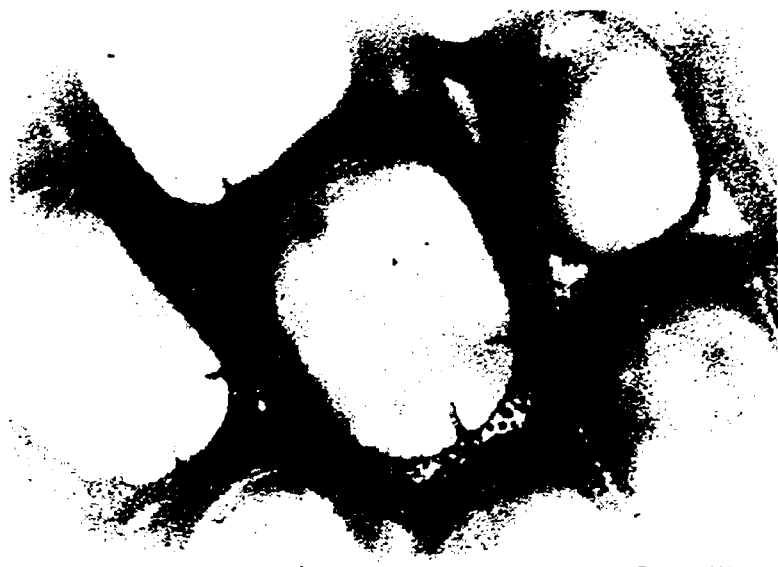
Fig. 2. Membranipora savartii (18x)

Remarks : Observed only on one panel exposed during the month of August, 1983 at 22 m.