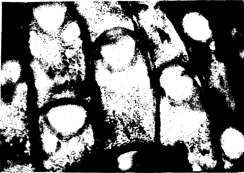
Fig. 4. Thalamoporella stapifera (18x)

Family : Bicellariellidae Levinsen, 1909 Genus : Bugula Oken, 1815