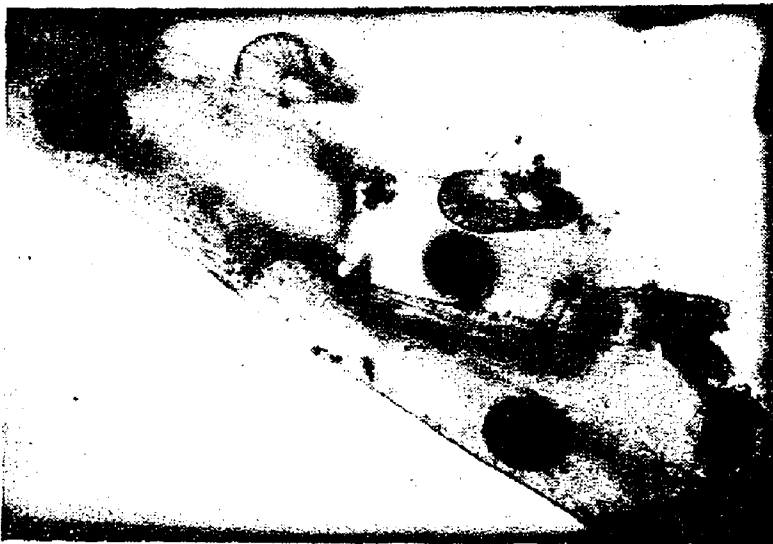
Fig. 6. Bugula bengalensis (18x)

Description : Opesia occupies nearly 2/3rd of the length of the zooid. The distal spine formula is 2:1. Avicularia situated above the mid-point of the zooid on the lateral margin, shorter head. Ovicells globose.