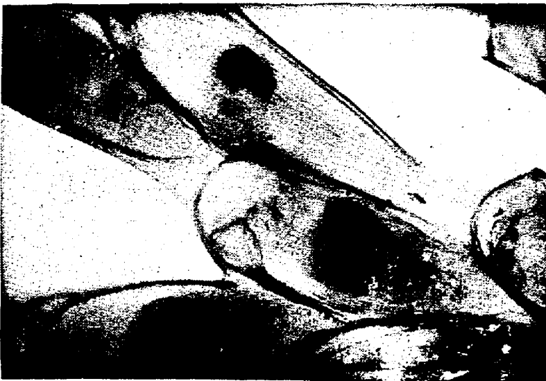
Fig. 5. Bugula neritina (18x)

Description : Erect colony, brownish in colour. Branches are composed of zooecia in two series. No spines present, but the free distal angle of the outer margin projects slightly. Avicularia absent.