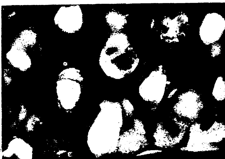
Fig. 7. Rimulostoma signatum (18x)

Description : Numerous, minute, regularly arranged tubercles cover the frontal. Orifice with a sinus and two condyles. Avicularia unilateral, directed proximally, pointing obliquely outwards. Occasionally ovicells with minute pores. There may be two avicularia.