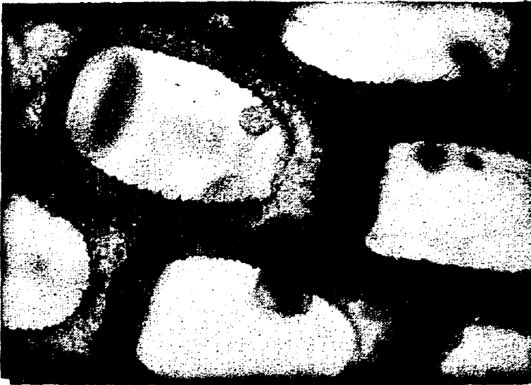
Fig.3. Membranipora perfragilis