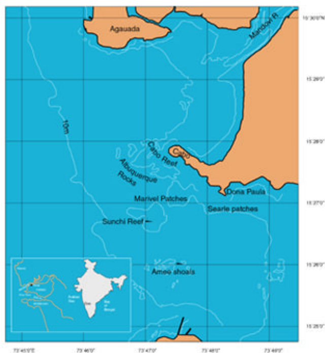
Figure 1. Location of Sunchi Reef.

The St George's Reef was probed to understand the extent of the wreck site. Utmost care was taken to prevent