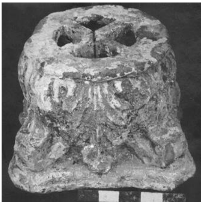
Figure 5. Corinthian column capital from the shipwreck on St George's Reef.

The raw material for manufacture of tiles, namely clay or feldspar, was abundantly available on the banks of the River Netravati in Mangalore. The company introduced further technical changes in the manufacture of tiles; these included salt glazes and gas-fired kilns in order to obtain uniform temperatures. Tiles were transported throughout