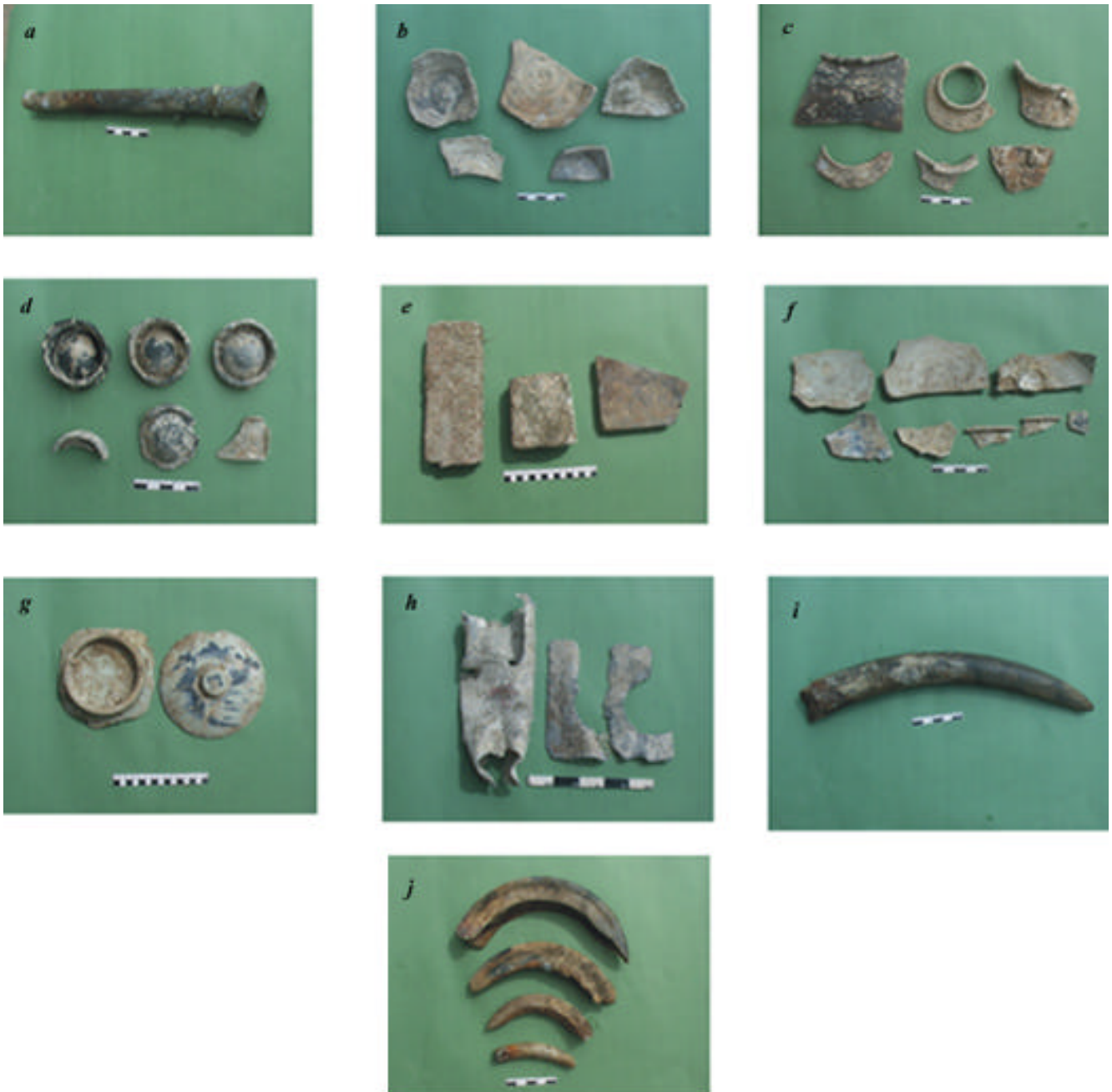
Figure 3 a–j. Artefacts recovered from Sunchi Reef. a , Brass barrel of a handgun; b , Martaban Pottery bases; c , Martaban Pottery rims; d , Broken bases (round and square) glass bottles; e , Stone bricks (?); f , Chinese ceramic (bases and rims); g , Chinese ceramic base and lid; h , Lead pipe and pieces; i , Elephant tusk; j , Hippopotamus teeth.

Lead pipe and pieces: A lead pipe having length 37.5 cm and diameter 36 cm and two pieces have been recovered from the wreck site (Figure 3 h ). The pieces are very fragile and worn out. The pipe has a few square holes, which are twisted and worn out. It appears that the pieces were used for sheathing and the pipe was used, as an outer cover to protect hosepipe or tube or it is used as a water pipe. The two pieces have teeth-like projections