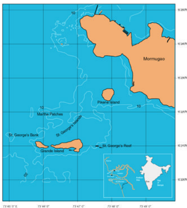
Figure 2. Location of St George's Reef wreck.

Explorations revealed four guns, a shot, iron anchor, elephant tusks, hippopotamus teeth, Martaban pottery, Chinese ceramic, bases of glass bottles, metal hook, dressed granite blocks, a brass barrel of a handgun, lead pipe, square and rectangular small stone pieces which appear like bricks(?).