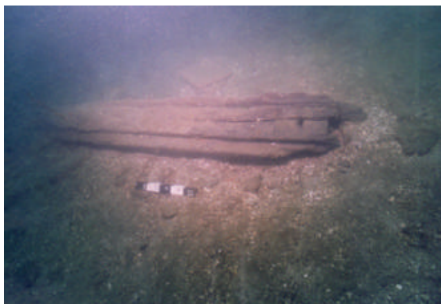
Figure 6. Remains of timber from the wrecked vessel on St George's Reef.