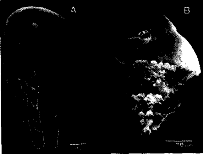
Fig.-2. Scanning Electron Microphotographs of (A) Bulimina costata d'Orbigny (B) Bulimina marginata d'Orbigny.