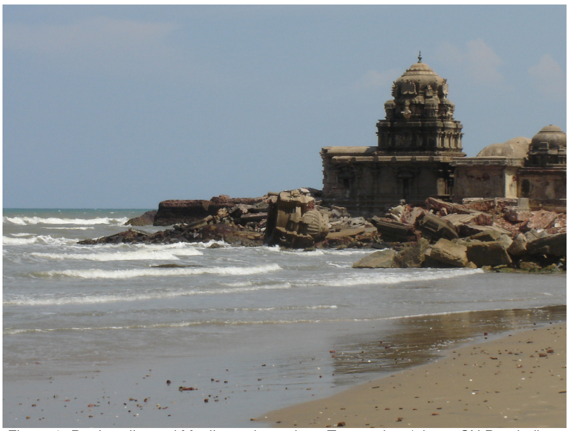
Figure 3. Partly collapsed Masilamani temple at Tranquebar

Tranquebar, a principal port during Danish rule (1620 AD-1845 AD), is situated about 15 km south of Poompuhar. The 13<sup>th</sup> century Masilamani temple is partly collapsed and the remains are found scattered in the inter-tidal zone (Figure 3). Two brick wells were found exposed in the inter-tidal zone. There is also evidence on the destruction of modern houses due to the encroachment of the sea (Sundaresh, et al. 1997:595, 593-98).