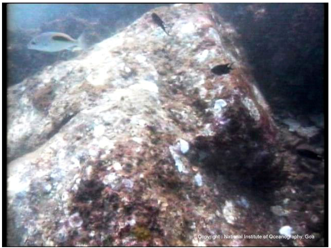
Figure 4. Stone block with a joinery projection found off Mahabalipuram

Dressed granite blocks were used for the construction of this structure. A wall about 250x65 cm with two to four courses is noticed. Huge rectangular blocks measuring approximately 2x1x1.5 m were also noticed on the central upper portion of the structure. Another wall measuring about 5.4 m in length was seen on the northern side along with two parallel walls on the southern side of the main structure, with a stair-like structure leading upwards. Further on the northern side, the remains of a wall extend up to 15 m in length. The length of some of these six walls varies from 7 to 32.5 m; the other walls being shorter in length. A floor measuring 2x2.5 m was also noticed towards the north-western side of the structure. The entire structure has thick marine growth of sponges, shells, barnacles and mussels; a few blocks were cleaned and chisel marks were observed. One of the blocks shows that it has joinery projections for interconnecting the blocks (Figure 4; Sundaresh, et al. 2004:1233).