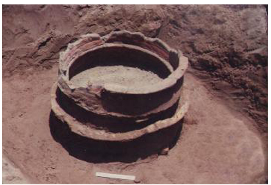
Figure 2. Terracotta ring well exposed in the intertidal zone at Poompuhar

During the course of explorations in the inter-tidal zone at Poompuhar the following were exposed: a brick structure of eleven layers running parallel to the coast with dimensions 1.2 m width, 1.2 m height and 4 m length; and a terracotta ring well with dimensions 25 centimetres (cm) high, 4 cm thick at the rim, and a diameter of 75 cm with three courses (Figure 2). Further, four brick structures of 25 m length, 3.4 m width aligned in a straight line, were noticed at a water depth of 1 m, opposite to present Cauvery temple at Poompuhar. The size of the bricks is 22x13x6 cm.