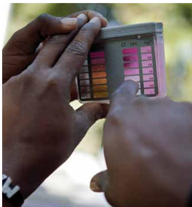
Testing the chlorination level in the water distributed in a camp next to the neighborhood of Cite de Dieu in Port-au-Prince.