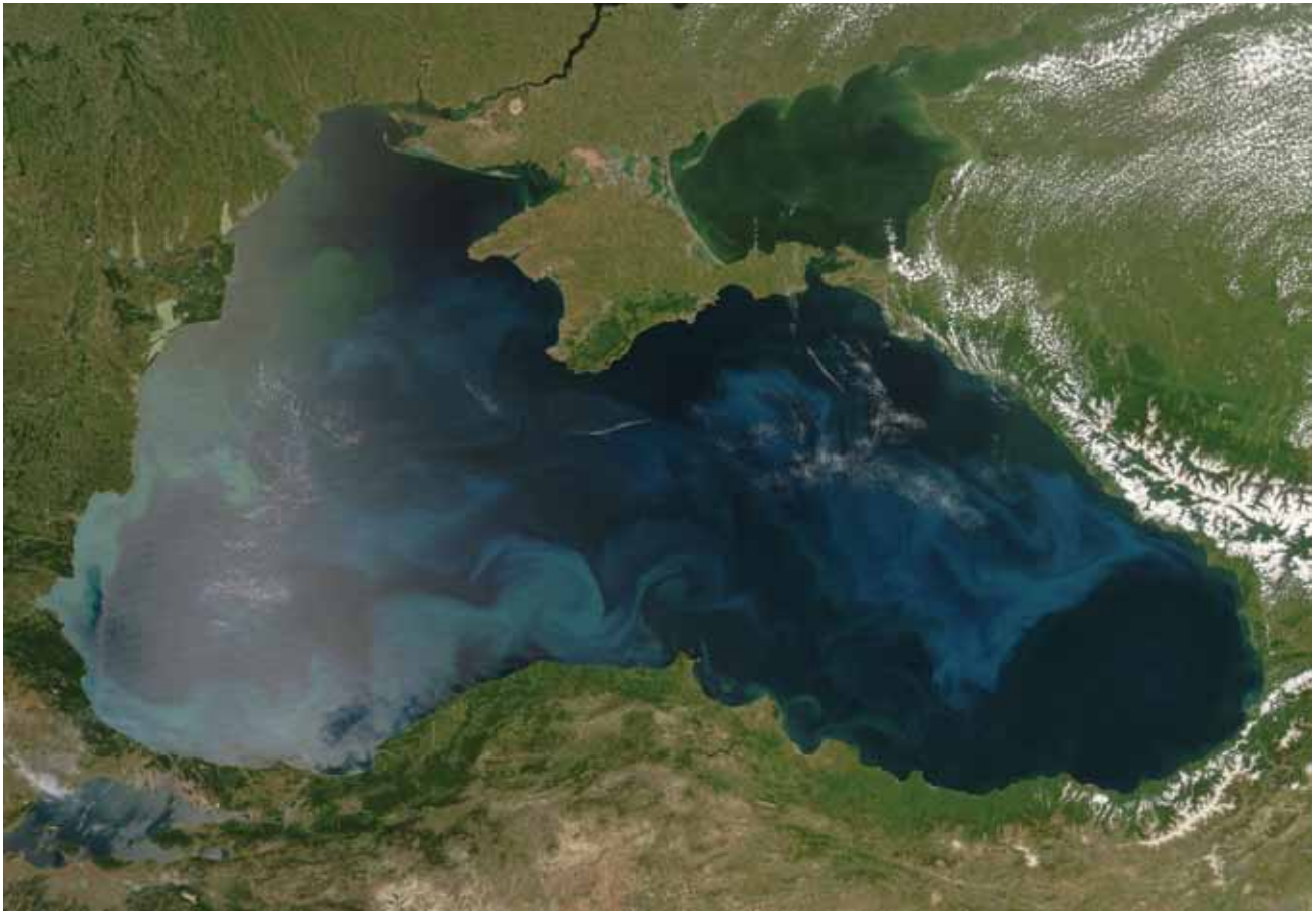
Satellite Image of the Black Sea

the case of ground water polluted by intensive live-stock production, for instance, hydrological conditions may delay the impacts of successful reduction measures by up to several decades, depending on the hydrological conditions. In these cases where changes are slow to show, inventories of pollution loadings can be more infrequently compiled, say on a five-year basis.