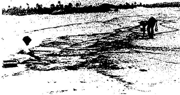
Sinquerim beach, Goa: Tar deposition at different tide levels during 1973.