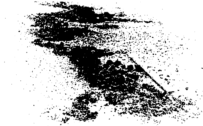
Calicut beach, Kerala State: Tar ball deposition during 1973.