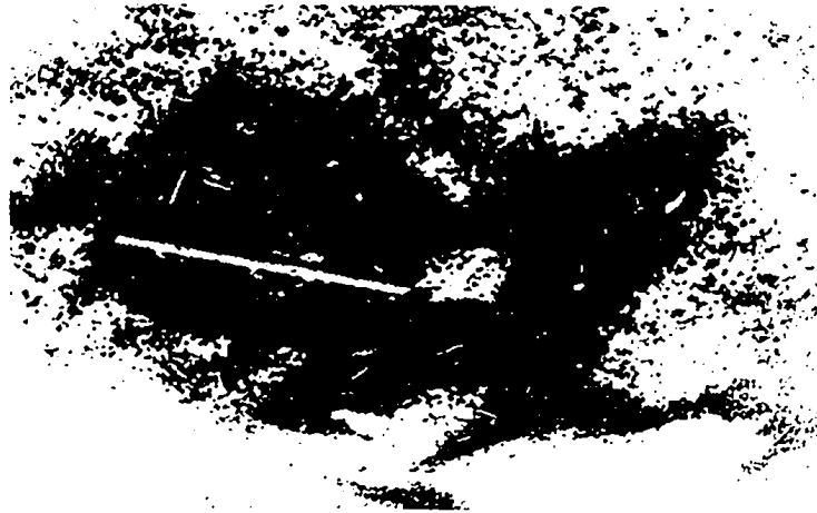
Maravanthe beach, Karnataka State: Tar ball deposition during July 1973.