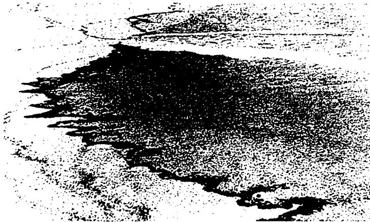
Candolim beach, Goa: Tar balls in the process of deposition during July 1973.