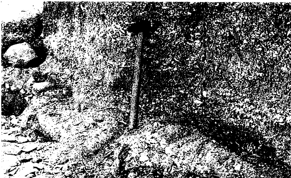
FIGS. 1-2. Beach rock exposures at Chapora-Vagator and Bogmalo beaches: 1, beach sandstone at the beach, Chapora-Vagator beach; 2, shelly beach rock, Bogmalo beach.

Ammonia beccari and its variants, Elphidium excavatum , E. crispum , Quinqueloculina seminulum , Miliammina fusca are very characteristic of beach subfacies and turbulent zone in the littoral facies. They are also found in the estuarine shallow water (brackish water) regions.