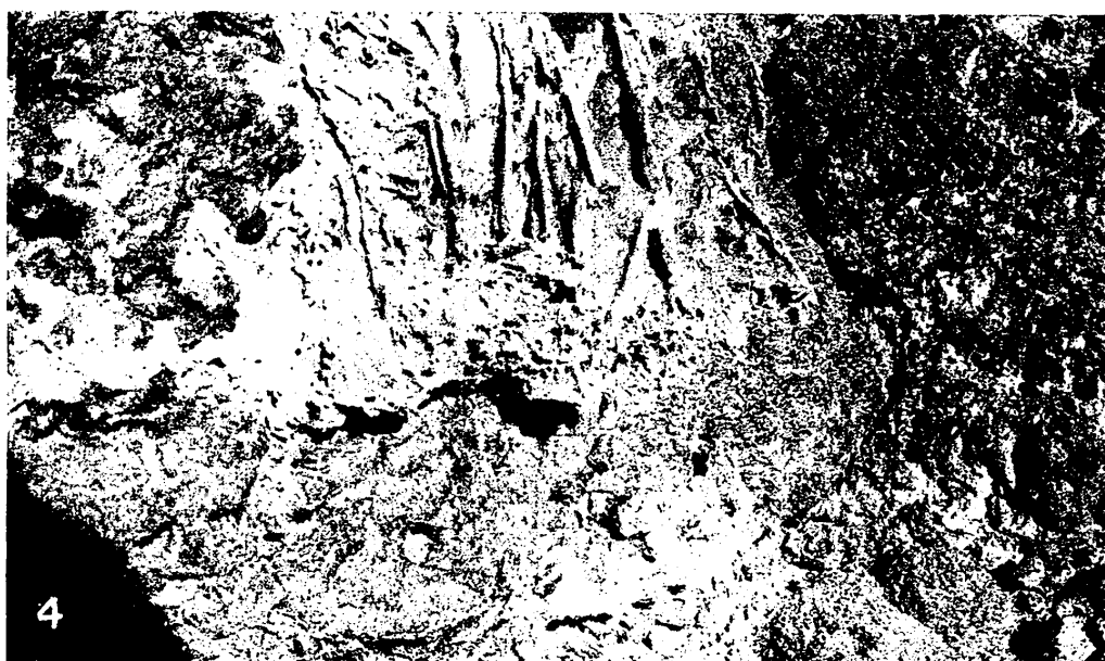
FIGS. 3-4. Beach rock exposure at Chapora-Vagator and Bogmalo beaches: 3, beach sandstone exposed in a cliff at Bogmalo beach; 4, calcified tubes of palm roots, Bogmalo beach.

Ammonia beccari (Linné) is abundant in this material. It is characteristic of 5-60 fathom depth and it can tolerate a temperature range of 18-25°C but is sometimes capable of withstanding up to 31°C. Hence it is very commonly found in almost all the beach deposits of the tropical, subtropical, and even transitional