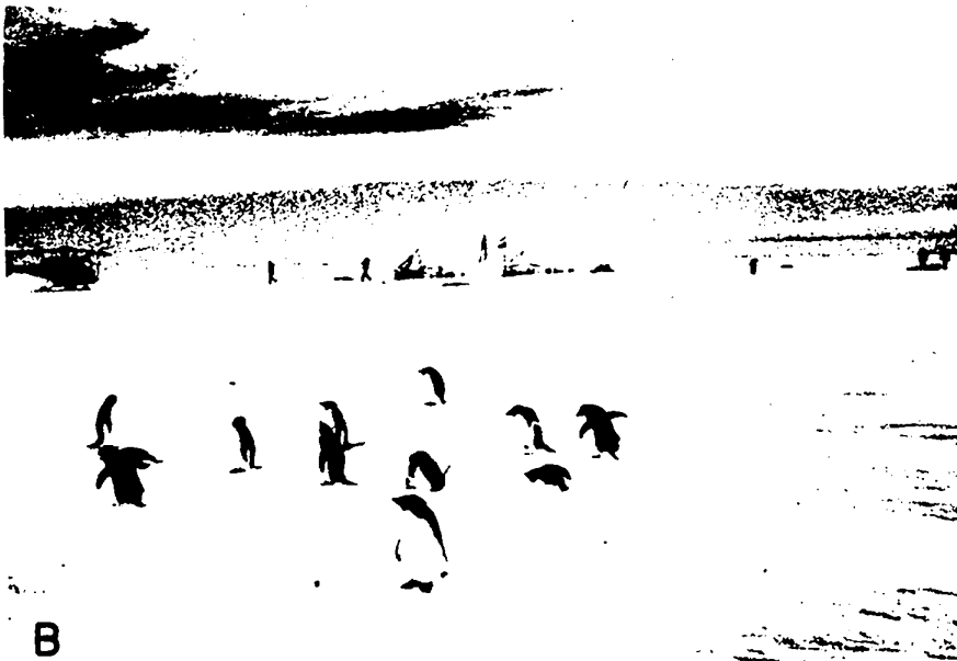
Plate 1B: A flock of Adelie Penguin (Pygoscelis adeliae), with Indian base camp in the background.