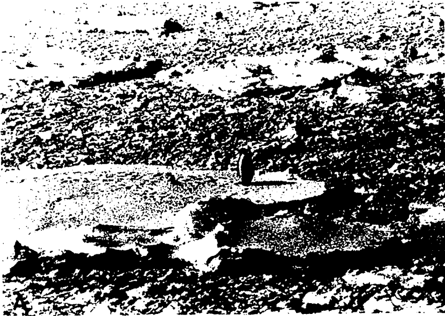
Plate 1A: A solitary Emperor Penguin (Aptenodytes forsteri) on pack ice.