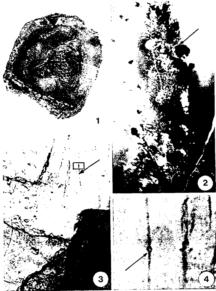
Figs. 1 to 4 Crassostrea cucullata infected with Ostracoblabe implexa . Fig. 1. Infected oyster shell showing dark coloured flecks (arrow). Fig. 2. Higher magnification of rectangle showing white nodules (W) and black flecks (arrow) ( \times 15 ). Fig. 3. Fungal mycelium (arrow) inside the shell ( \times 100 ). Fig. 4. Higher magnification of rectangle showing fungal mycelium with proclamydospore (arrow) ( \times 5200 )