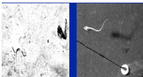
Fig. 2. Benthic organisms observed before the disturbance experiment

The Indian Deep-sea Environment Experiment (INDEX) was conducted by National Institute of Oceanography (Goa, India) in 1997 in a pre-selected area in the Central Indian Ocean Basin after a detailed baseline study from 1995-97. The DSSRS was used 26 times in an area of 200x3000 m, during which about 6000 m 3 of sediment was resuspended (Sharma and Nath, 1997). Photographic surveys showed destruction of benthic organisms due to the movement of the disturber on the seafloor as compared to that before the experiment (Fig. 2, 3). The post disturbance impact assessment studies have indicated that the effects of disturbance are the highest in and around the disturbance area (Sharma et al., 2001) and differential effects on microbial, meio and macrobenthos within and outside the disturbance track (Ingole et al., 1999, Nair et al., 2000). Longterm monitoring of re-colonisation and restoration of the benthic environment has indicated that natural conditions have set in over a period of time.