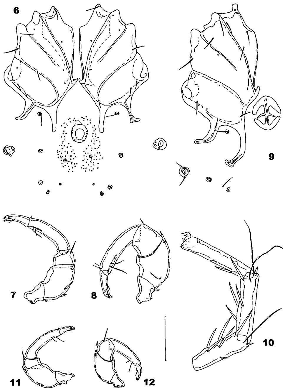
FIGURES 6-12. Litarachna denhami (Lohmann, 1909) (6-7, 11-12 = male, 8-10 = female; 6-10 specimens from Korea, 11-12 specimen from India): 6 = idiosoma, ventral view; 7-8 = palp; 9 = coxal and genital field; 10 = IV-Leg-4/6; 11-12 = palp. Scale bar = 100 \mu m.