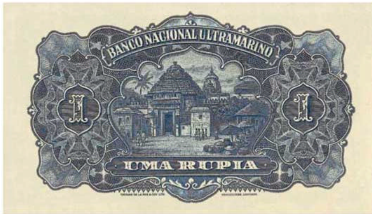
Fig. 2b. Reverse side of the Portuguese currency depicts the Jagannath temple.