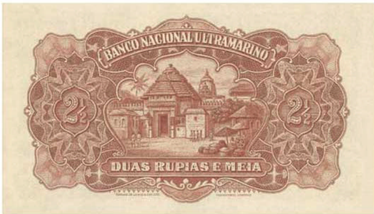
Fig. 3. Depiction of the Jagannath temple of Puri on 2.50 Rupia paper currency.