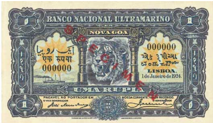
Fig. 2 a. Obverse side of the Portuguese currency depicts the details.