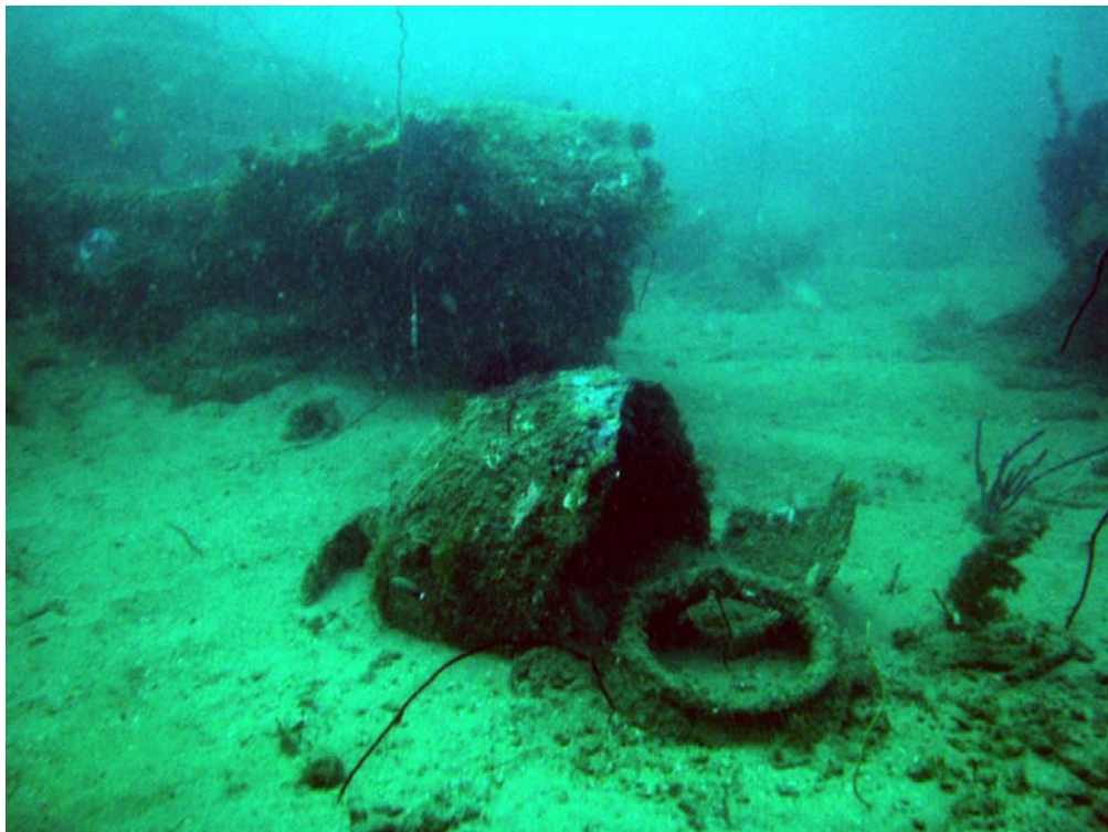
Figure 4. Large size jar noticed exposed in a shipwreck off Godawaya, Sri Lanka