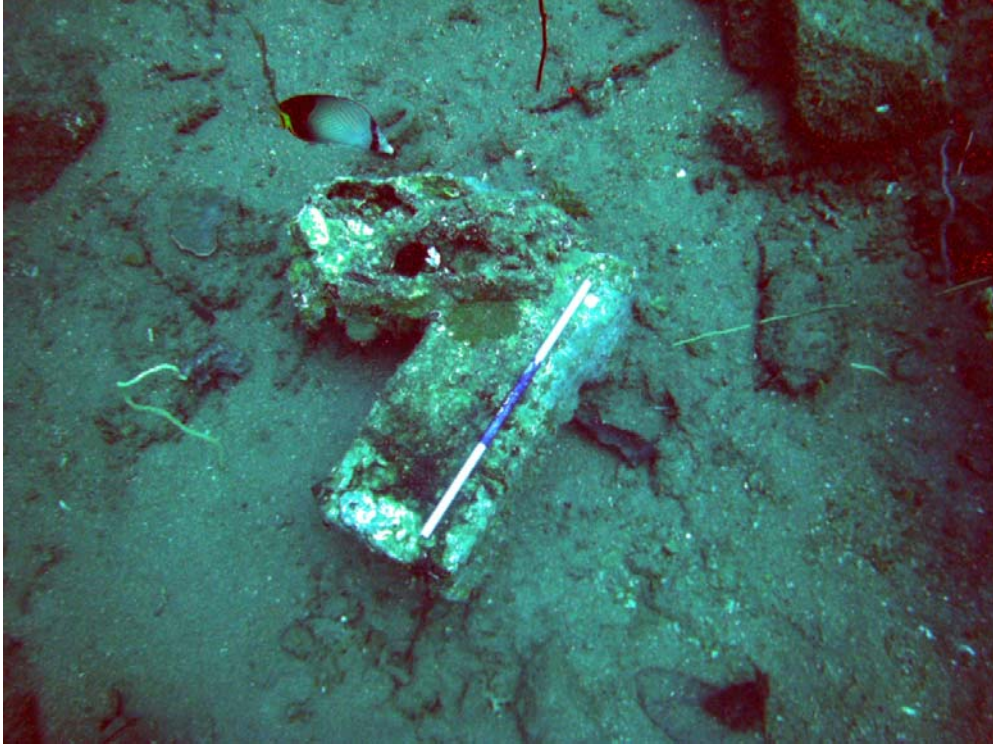
Figure 5. Stone quern noticed exposed in a shipwreck off Godawaya, Sri Lanka