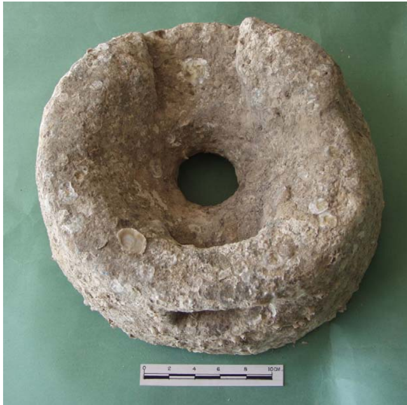
Figure 3. Roman hand mill from offshore region of Bet Dwarka Island