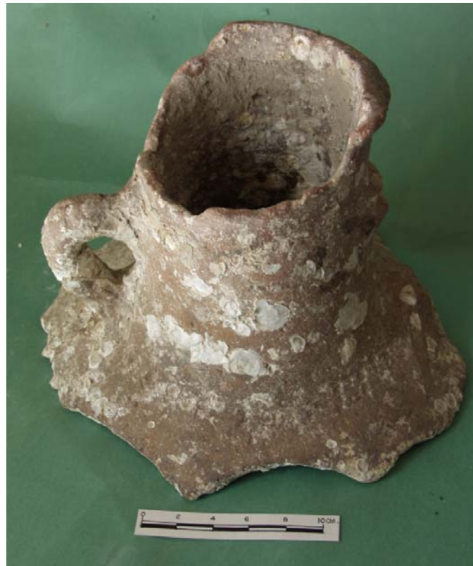
Figure 2. Amphora from offshore region of Bet Dwarka Island