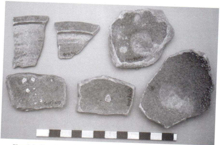
Plate 2.2 : Glazed ware sherds were noticed in inter tidal zone off Ghogha