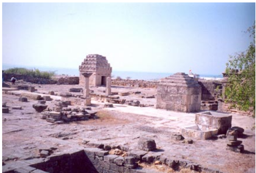
Figure 2. Protected temple complex on the shore of Pindara. The temples date back to 7th to 10th century AD.