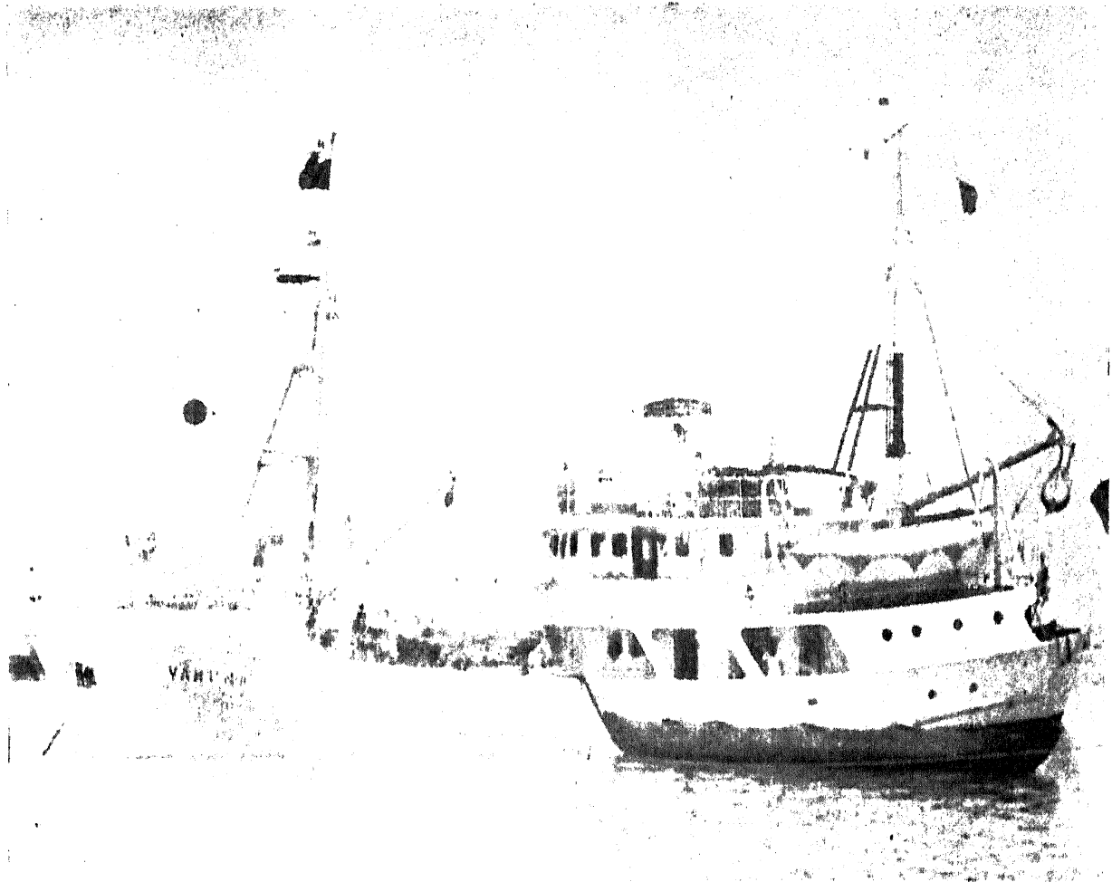
FIG. 2. 'R. V. Varuna'—Indo Norwegian Project Fishery Research Vessel. Second participating ship in the Indian Programme.

The Marine Geology and Geophysics Programme includes magnetic, seismic and gravity studies but the Indian Programme is likely to be slow in implementation owing to inadequate instrumentation. Regular Echo-Sounding with the precision depth recorder will, however, be made for getting profiles of the ocean bottom all along the routes taken by the ships, so that the data collected could be used to develop accurate bathymetric charts.