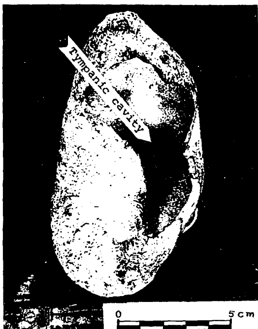
Fig. 1 - Tympanic bulla showing tympanic cavity and Fe-Mn oxide thin coating

Sample taken from the inner fresh part was powdered to -230 mesh, packed in an aluminium holder and scanned from 20^{\circ}2\theta to 36^{\circ}2\theta on a Philips XRD. Samples from inner fresh part and 3 mm thick pitted surface (Fig. 2) on which Fe-Mn coating was found were analysed in duplicate for Mn, Fe, Co, Ni and Cu along with USGS A-1 manganese nodule standard. During the sampling of surface a substantial amount of bone material was mixed up with Fe-Mn oxide coating material. All samples in duplicate were finely ground, dried at 105^{\circ}C for 12 h, cooled in desiccator and weighed. Dried samples were dissolved in 3N HCl without destroying the collagen. The residue left over after digestion was filtered through Watman filter paper (no. 42) then dried and weighed. The weight of insoluble residue was deducted from the original dry weight of the sample and used for the metal concentration calculations. The sample solutions were analysed on atomic absorption spectrophotometer (Perkin-Elmer, PE-5000).