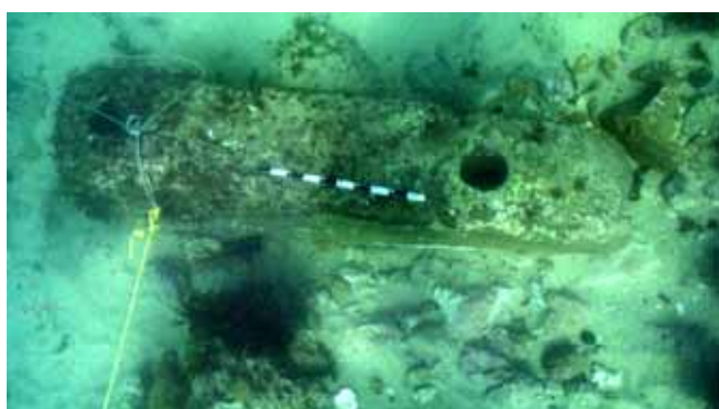
Figure 8. Stone anchor lying at 5 m water depth.

were trapped in these channels and between the rocks, which were suitable for holding big boats like the Arab ‘Dhows’ and the Indian ‘Vahan’. Observations at Bet Dwarka and Porbandar revealed that boats carrying more than 100 tonnes of cargo anchored at a water depth of 4–5 m; sometime they also rested on the sandy beaches during low tide. However, at Somnath most of the anchors were