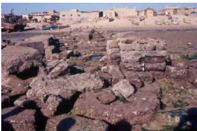
Figure 4. Remains of an ancient jetty at Rupen Bandar exposed during low tide.

The study of the existing traditional jetties along the west coast of India suggests that the Gujarat coast does not have jetties built of wood, while going down to the Maharashtra and Karnataka coasts, wooden jetties are found, many still operational, particularly in backwater areas by local fishing trawlers and canoes. Indeed, the presence and absence of a jetty at a recognized port could well be