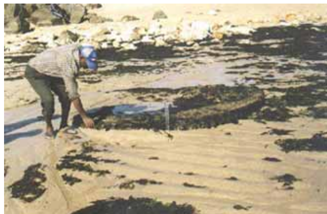
Figure 3. Base of a Pillar of an ancient jetty, exposed during low tide off Dwarka.