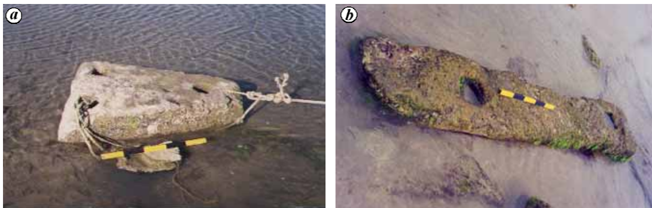
Figure 6. Stone anchor lying in inter-tidal zone of Aramda (a) and Dwarka (b) in Okhamadal area.