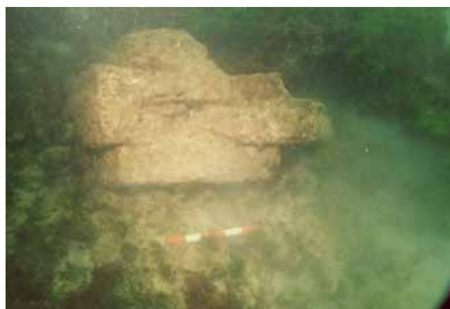
Figure 2. Collapsed structure of an ancient jetty off Dwarka.

Rupen Bandar, a fishing harbour 2 km north of Dwarka, also has the remains of a jetty that is 100 m when measured from the high water line. Here, evidence suggests that wooden logs were secured in a stone pillar. With time, parts of the stone structure were damaged and salvaged for use elsewhere (robbed-off). Though this appears to be a common phenomenon, presently three rows of wooden logs (jetty piles supporting the deck beams and the deck itself) remain strongly secured deep in the sediment (Figure 4). The oral history indicates that this jetty is at least a century old.