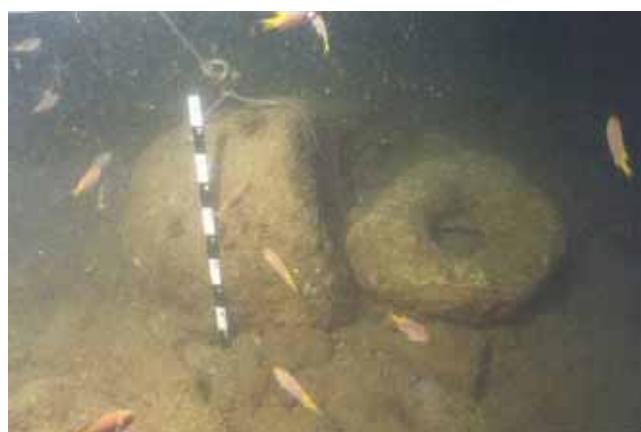
Figure 9. A ring stone type anchor lying at 9 m water depth off Somnath.