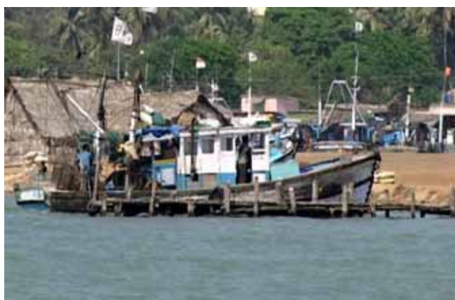
Figure 7. A fishing boat anchored along the wooden jetty at Mangalore port.