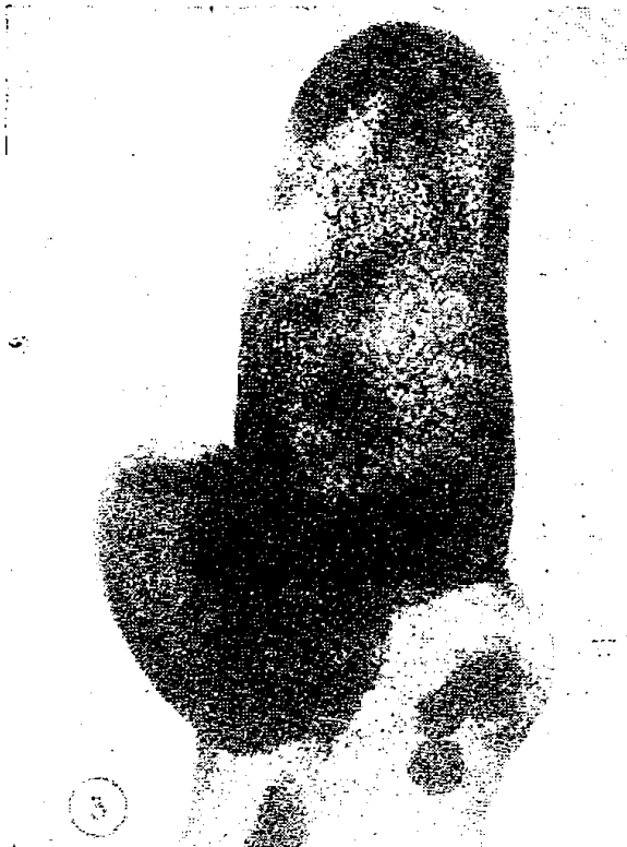
Plate 3. E. verticillata : branch tip, \times 96 .