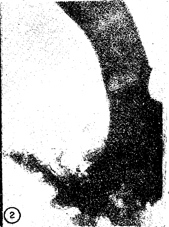
Plate 2. E. verticillata rhizoid, annularly constricted, \times 96 .