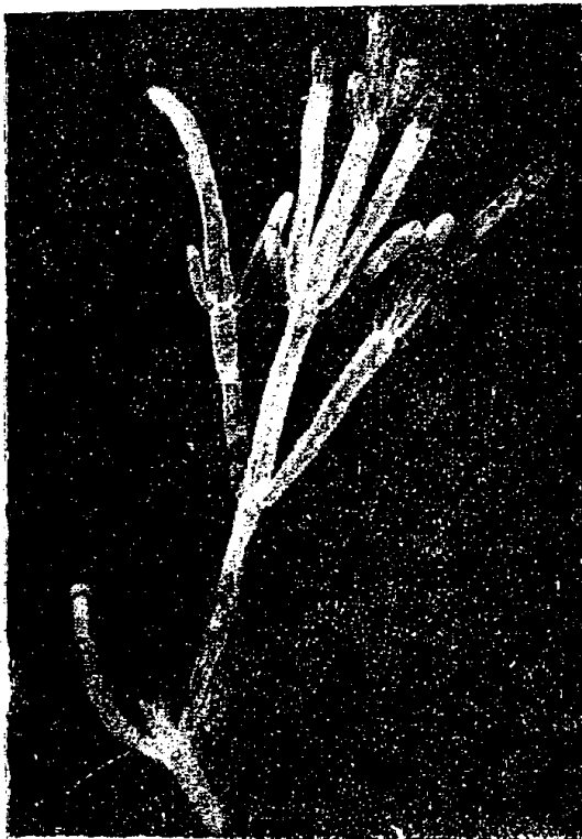
Plate 1. E. verticillata : entire plant.